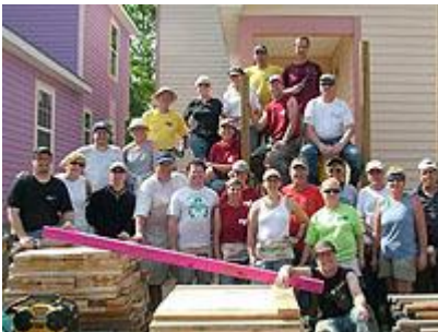
Several Presbyterian Church (U.S.A.) congregations joined together and traveled to New Orleans for home repair.